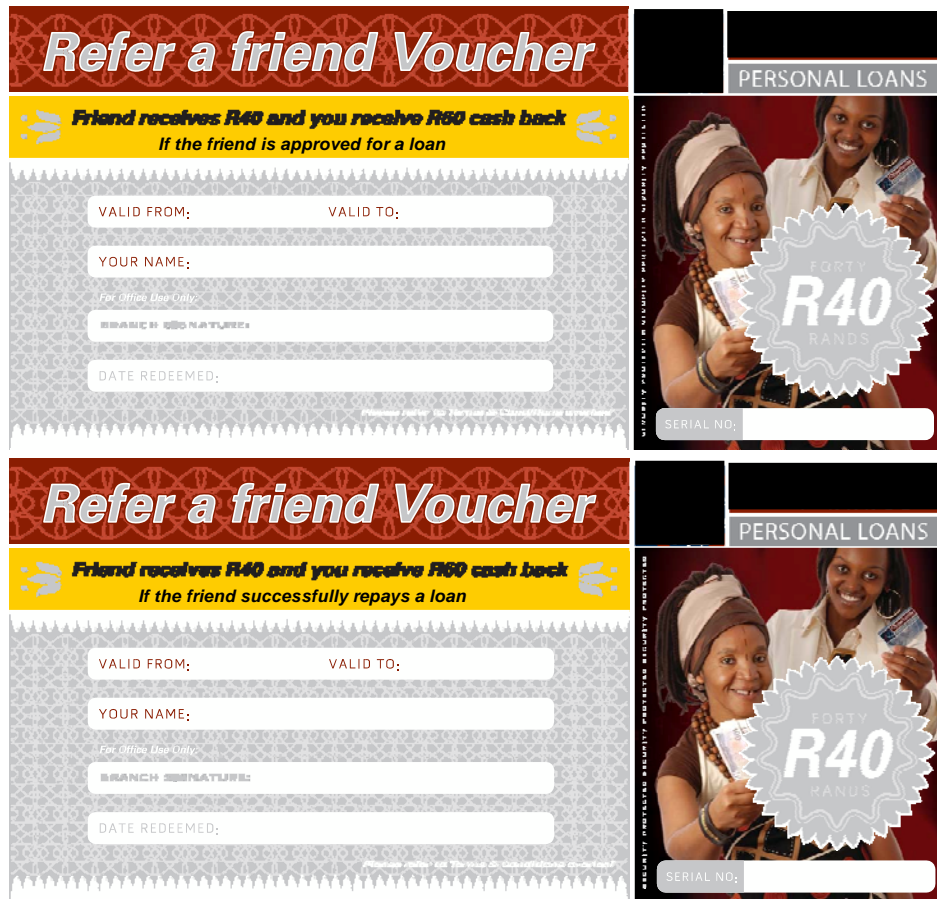
Figure 1: Referral Cards

change. Among referrers who had been given the ex-ante approval incentive, half were assigned to receive an additional ex-post repayment incentive. Opportunity phoned referrers in this group and told them that, in addition to the R100 approval bonus, they would receive an additional R100 if the referred repaid the loan. The other half of referrers who had been given the approval incentive ex-ante were contacted by Opportunity and reminded to pick up their R100 bonus. (Opportunity did not provide any new information on the incentive contract to these referrers, but we wanted referrers in both ex-post arms to receive a phone call from Opportunity in case the personalized contact from the lender had some effect.)