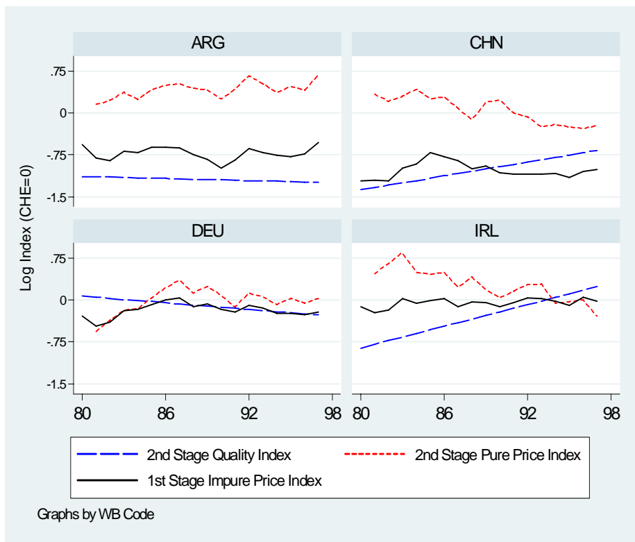
Figure 2: Second-Stage Relative Quality and Relative Pure Price Indexes, 1980 to 1997